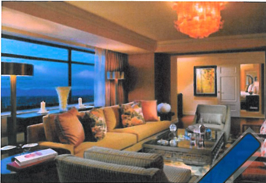
HIGH FIVE! The Ritz-Carlton, Denver was awarded AAA Five Diamond status this month. Above: Ritz-Carlton Suite.