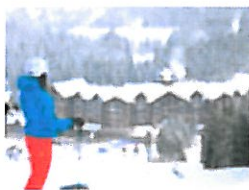
FIRST TRACKS One Ski Hill Place, Breckenridge.